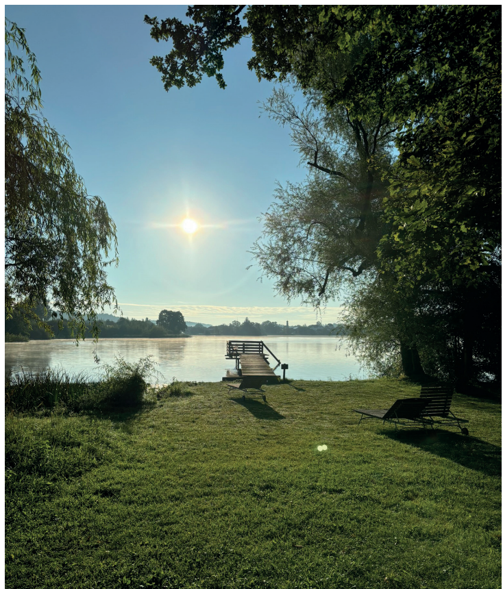
The lake right at Kloster Seeon invited its guests for a nice swim during their stay.