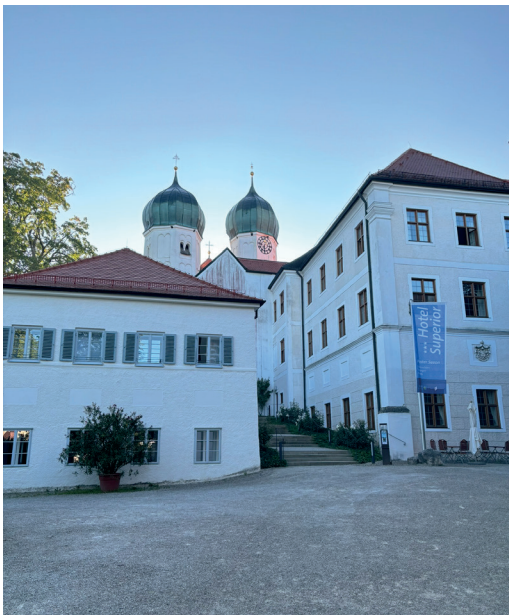
Entrance of Kloster Seeon