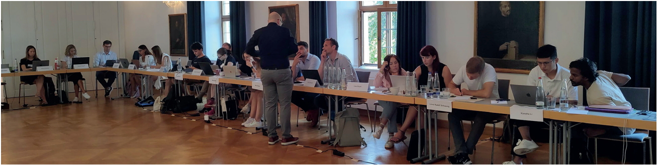
Various lectures of internationally renowned experts were held in the conference room.