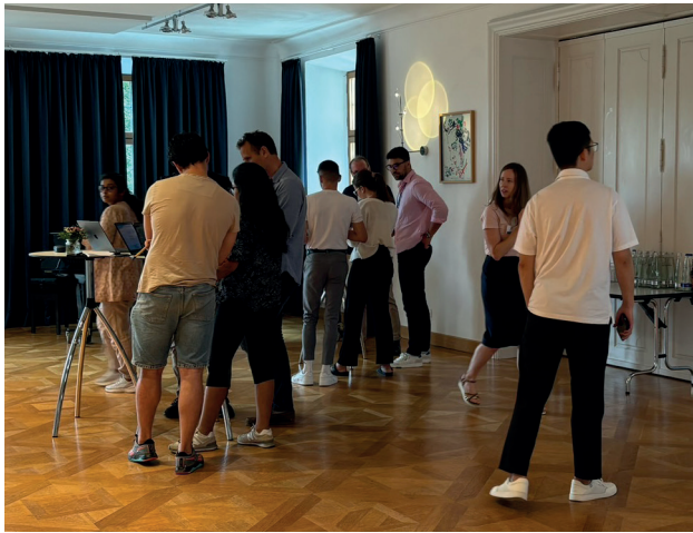
There were multiple options to work together during the Breakout Sessions.