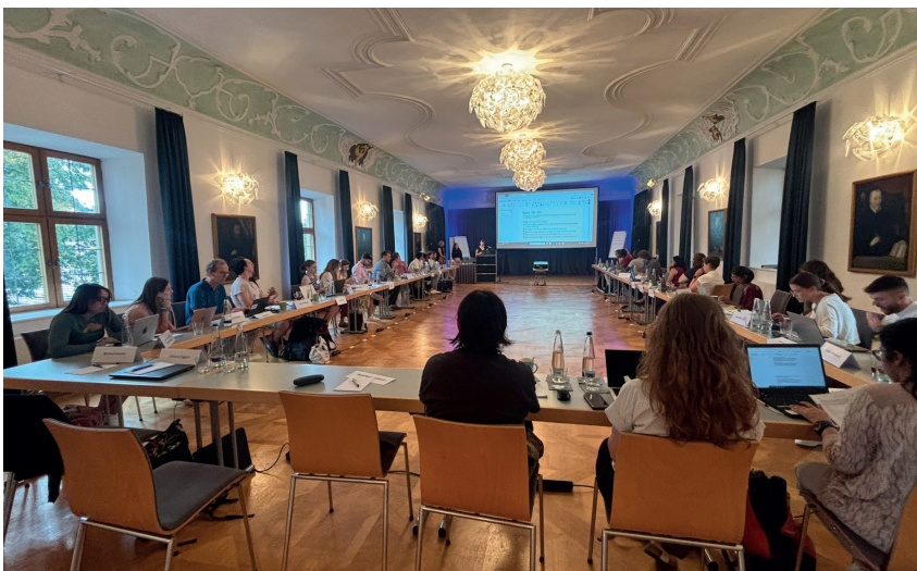
The presentation of the working group results is shown in this image.