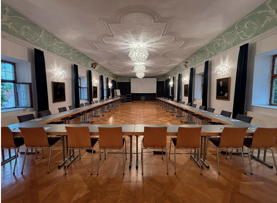
The conference room where the lectures of the Summer School took place.