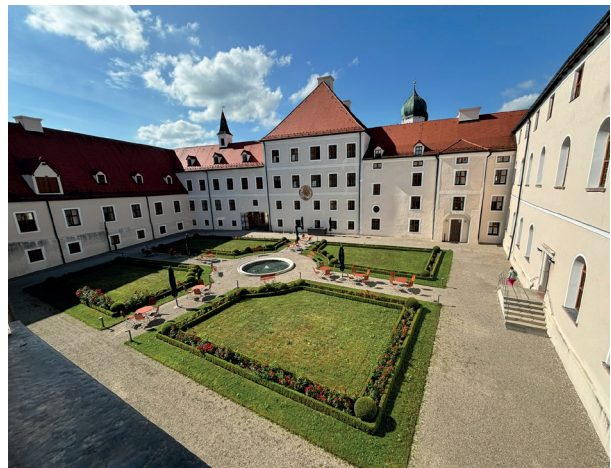
The monastery has a beautiful courtyard.